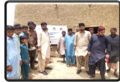
Naseerabad: The community/rehab works under cash for work is being implemented